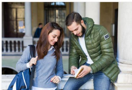
Orientation during studies