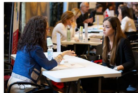
University and work