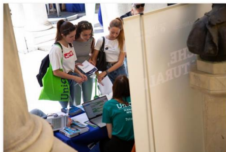
Guidance for choosing

UniGe supports students throughout all stages: